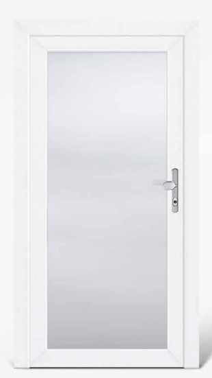
NTA 5 colour RAL 9016 traffic white glazing Iso light

U<sub>0</sub>-value: KF 404 S - 1,2 W/m<sup>2</sup>K U<sub>a</sub>-value: KF 694 - 1,3 W/m<sup>2</sup>K Ug-value: AT 65 - 1,9 W/m<sup>2</sup>K